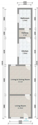
Milner Road Ground Floor