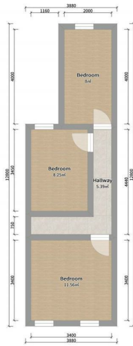
Milner Road First Floor